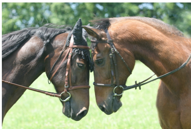
Toby (left) and Dancer in Spring 2008